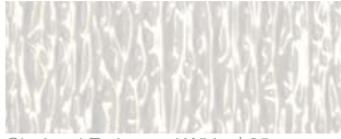
Glasbord Embossed White | 85